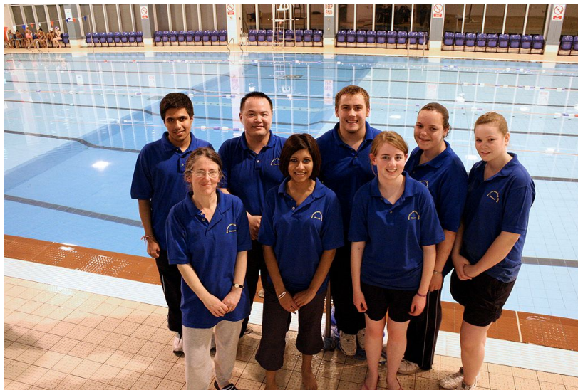
(ASA Level 2 Teaching Swimming / Aquatic holders)

“Striving for excellence, participation and succeeding!”